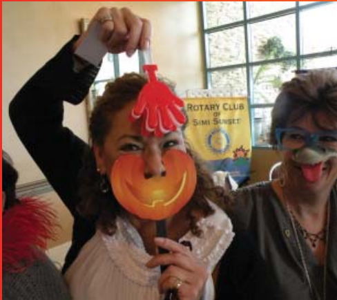
Who is that masked girl behind the pumpkin ?