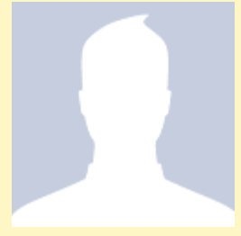
Might Be You ?